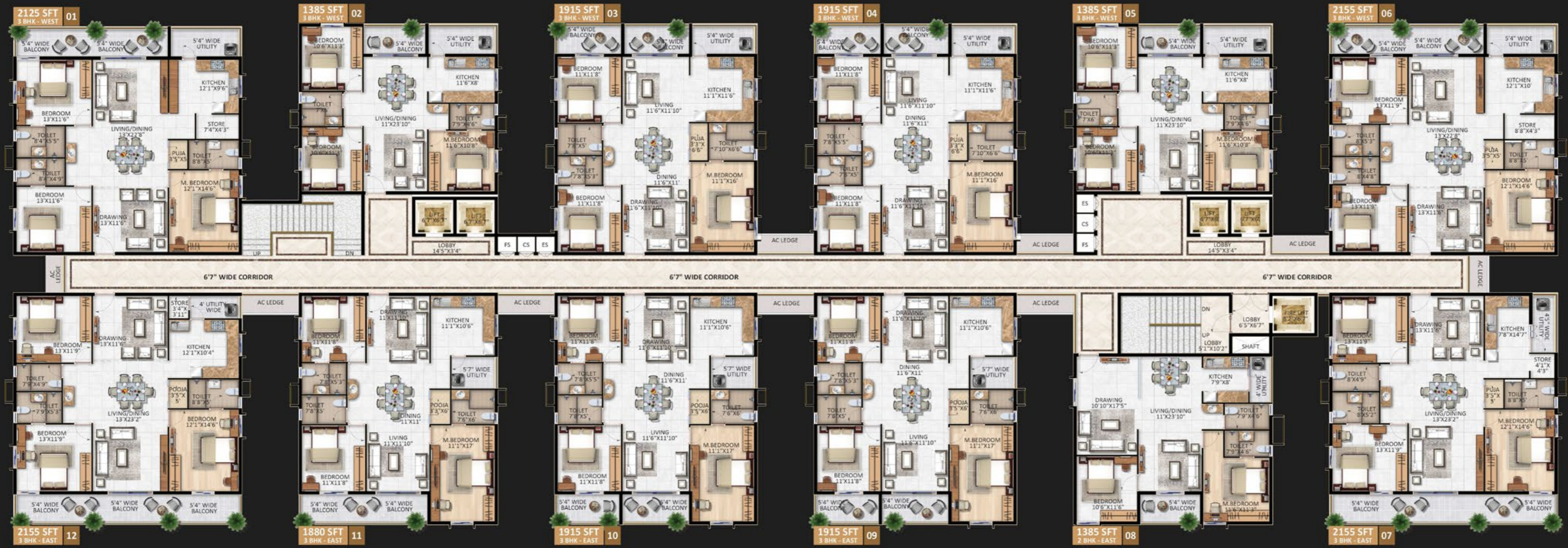
BLOCK - B TYPICAL FLOOR PLAN AREA STATEMENT IN SFT