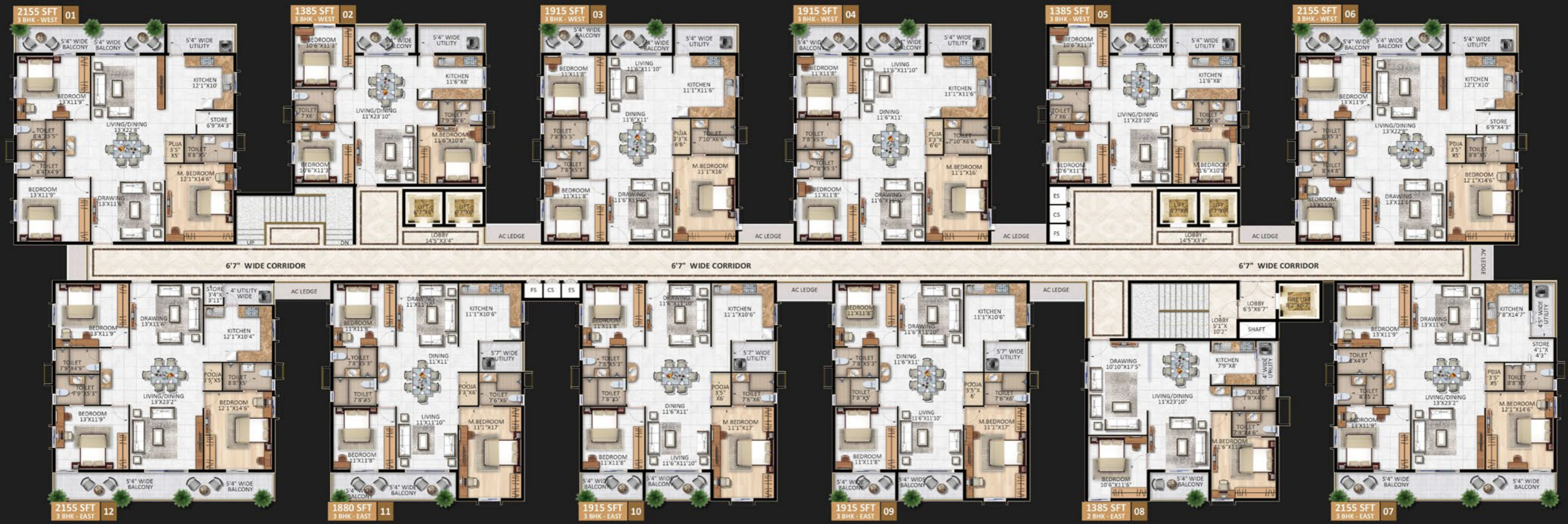
BLOCK - D TYPICAL FLOOR PLAN AREA STATEMENT IN SFT