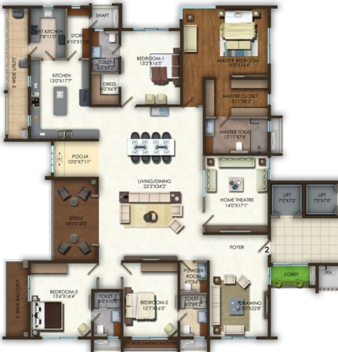
UNIT BLOCK C & D FLAT NO 2