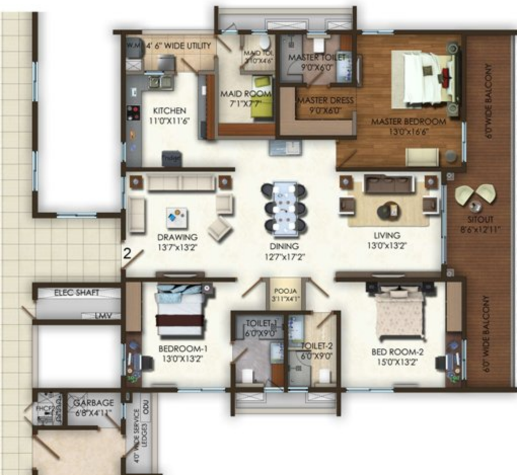
UNIT BLOCK F & A FLAT NO 2